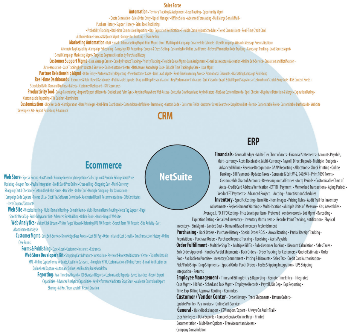
Figure 1: NetSuite's Broad Footprint of Functionality

From its inception, NetSuite set out to solve problems in not just one application area, but to provide a better way to run the most important processes in a business. With NetSuite, integration is inherent in the product. All enterprise functions are wrapped up in a single database, application, and version of code. With a few keystrokes, employees can convert an estimate into an order and produce an invoice. No one has to enter the same data more than once. Figure 1 shows the breadth and depth of the functionality that NetSuite offers.